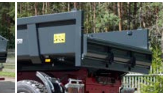
Hydraulic tailgate 14.6" | 370 mm high