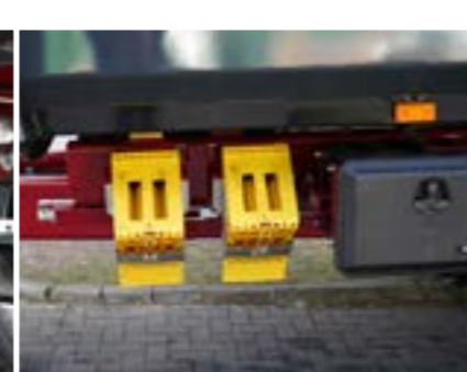
Wide range of optional equipment