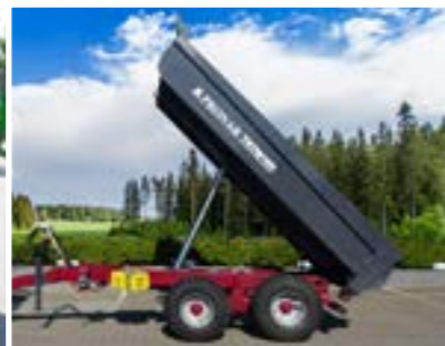
High tipping angle enables fast unloading