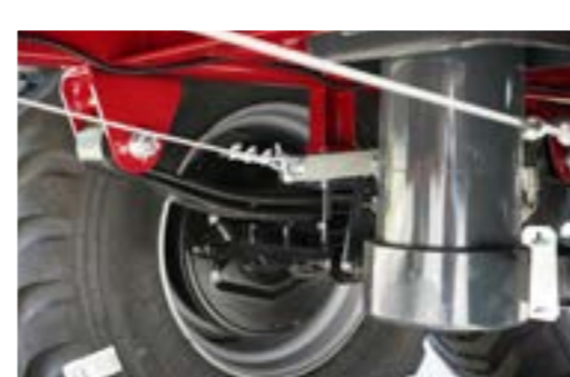
Tandem suspension with trailing arms; equipped with half axles with drum brakes