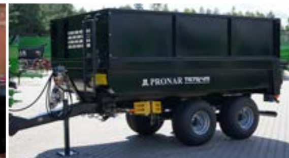
Special design: various RAL paints available as option; extensions 31.5" | 800 mm to increase loading volume