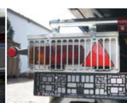
Rear lighting fitted with protective grids, for special working conditions