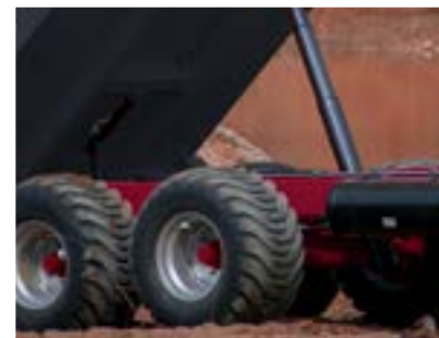
Tandem - chassis with drum brakes 11.8"x3.5" | 300x90mm