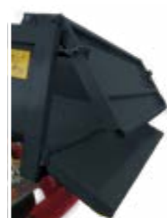
If required, additional rear pendulum flap available