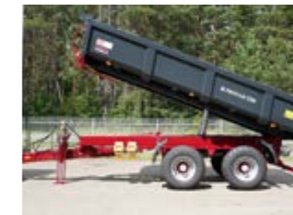
Sturdy construction for any application