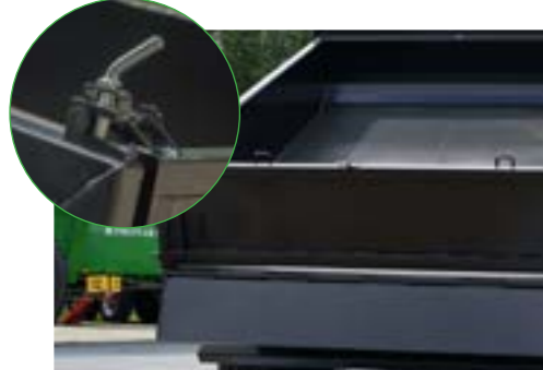
Swing tailgate for easier unloading