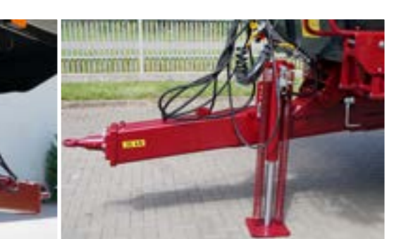
Reliable support leg thanks to hydraulic system