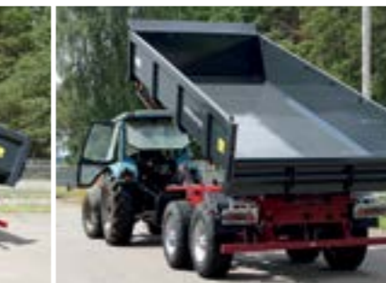
Thanks to the increased sheet metal thickness of the floor and drop sides, long-term use of the trailer is guaranteed