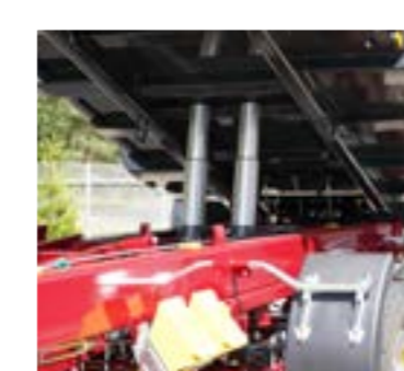
Two telescopic cylinders for reliable unloading