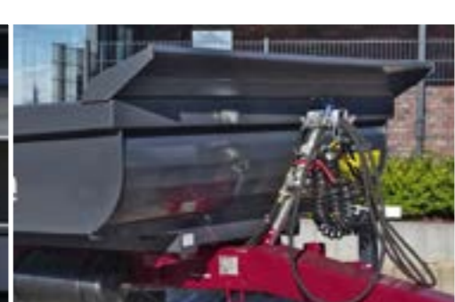
Rounded front wall of the body (adapted for the use of the ditching bucket)