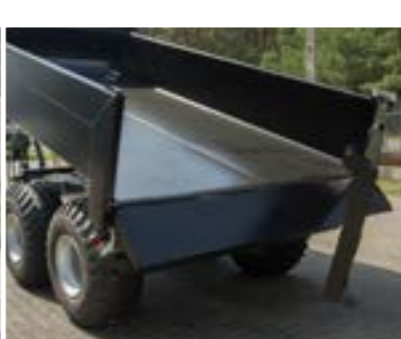
Swinging wing tailgate